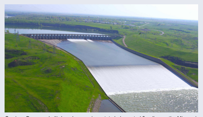
Garrison Dam was built decades ago, in part, to help control flooding on the Missouri River, the longest river in the country. In 2011, the emergency spillway gates at the dam were used for the first time to release floodwater.

The Missouri River was once free flowing with meandering braided channels, sand bars, and expansive tree-covered riparian areas. The river was free to make its own banks, which were ever changing, and seasonal flooding was a common occurrence. Today, six dams and reservoir projects make up the Missouri River reservoir system