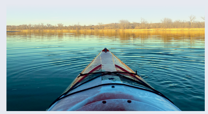
Each year, North Dakota residents and numerous tourists enjoy water-based recreational activities on the Missouri River.

For more information, please visit the Department of Water Resources' website at www.dwr.nd.gov.