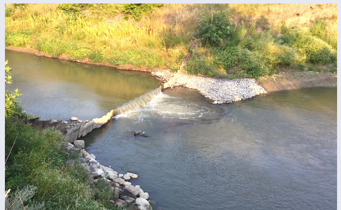
DWR's Dam Safety Program continually updates, maintains, and improves the state's inventory of dams.

Most low head dams in the state were constructed in the 1930s and are simple concrete or rock masonry structures that span the width of a river or stream and raise the upstream water level until it reaches a height sufficient to flow over the dam. Low head dams can create dangerous conditions and have been referred to as "drowning machines" and "killers in our rivers" by the Association of State Dam Safety Officials (ASDSO).